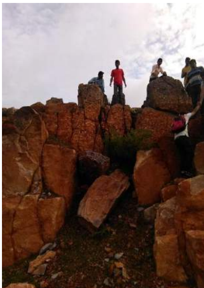
Conglomerate & Quartzite at Bagalkot