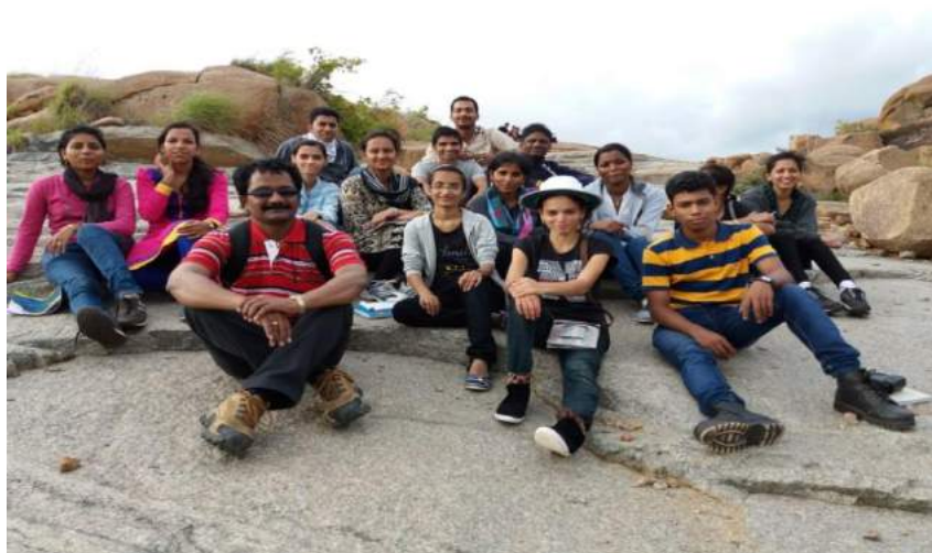
On Granite Batholith near Chitradurga.