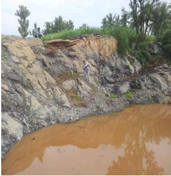
Stromatolitic Limestone Near Bagalkot.

d) Mapping and field training of M.Sc. Part-I students was carried out near Terekhol River near Sawantwadi.