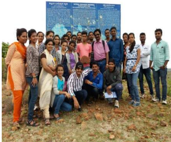
At GSI National monument, Maradihalli, Chitradurga.