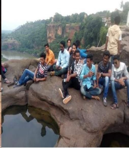
At Gokak Waterfalls.