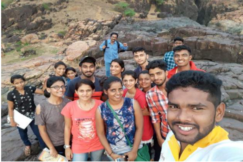
At Ankola, Karwar District.

2 Mapping and field training of M.Sc. Part-I students was carried out in and around Phonda area of Sindhudurg District.