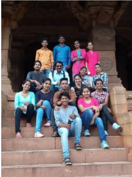
At Badami Caves