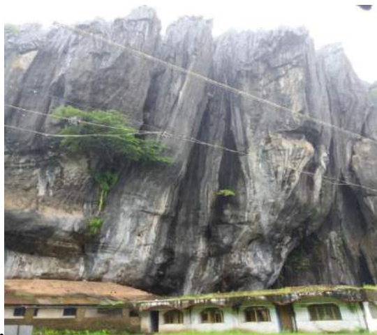
Yana Black Limestone in Karwar District.

Study tour of M.Sc. students was held at Chitradurga, Tioga , Karwar and nearby areas in Karnataka State.